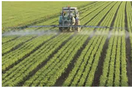
Agriculture & Horticulture