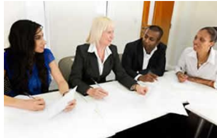
Management & Business