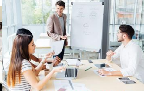
Training & Assessment