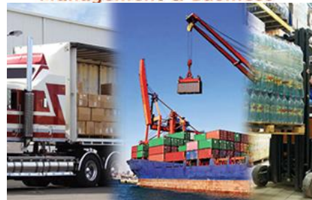
Transport & Logistics