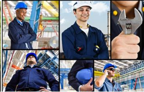
Workplace Health & Safety